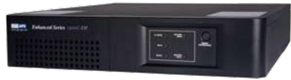
* ES1000C-RM/ ES1500C-RM

ESC-RM series offer the highest power capacity and the best equipment protection around. Not only do they protect against blackouts, sags and surges, but with the added feature of AVR (Automatic Voltage Regulator), these UPS products also ensure that only clean and safe currents reach your equipment.